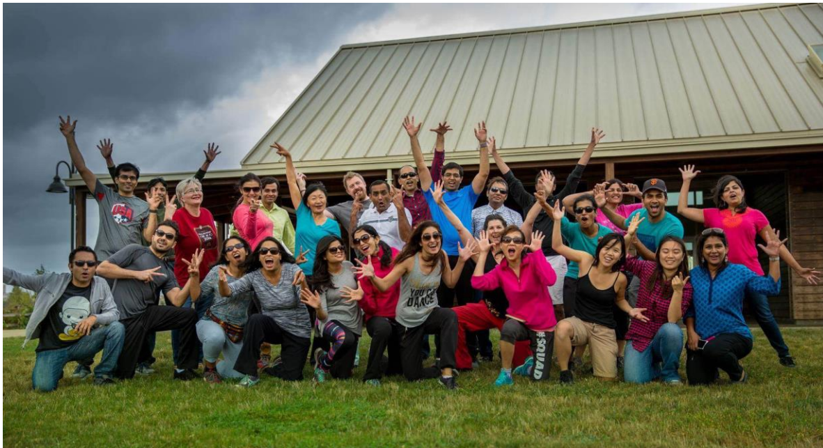
Participants posing for a photo after their Bollywood dance HPHP program at Martial Cottle Park.