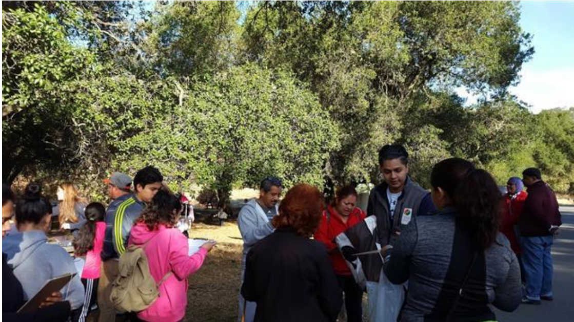
Researchers help program attendees fill out surveys for a San Francisco State University study.