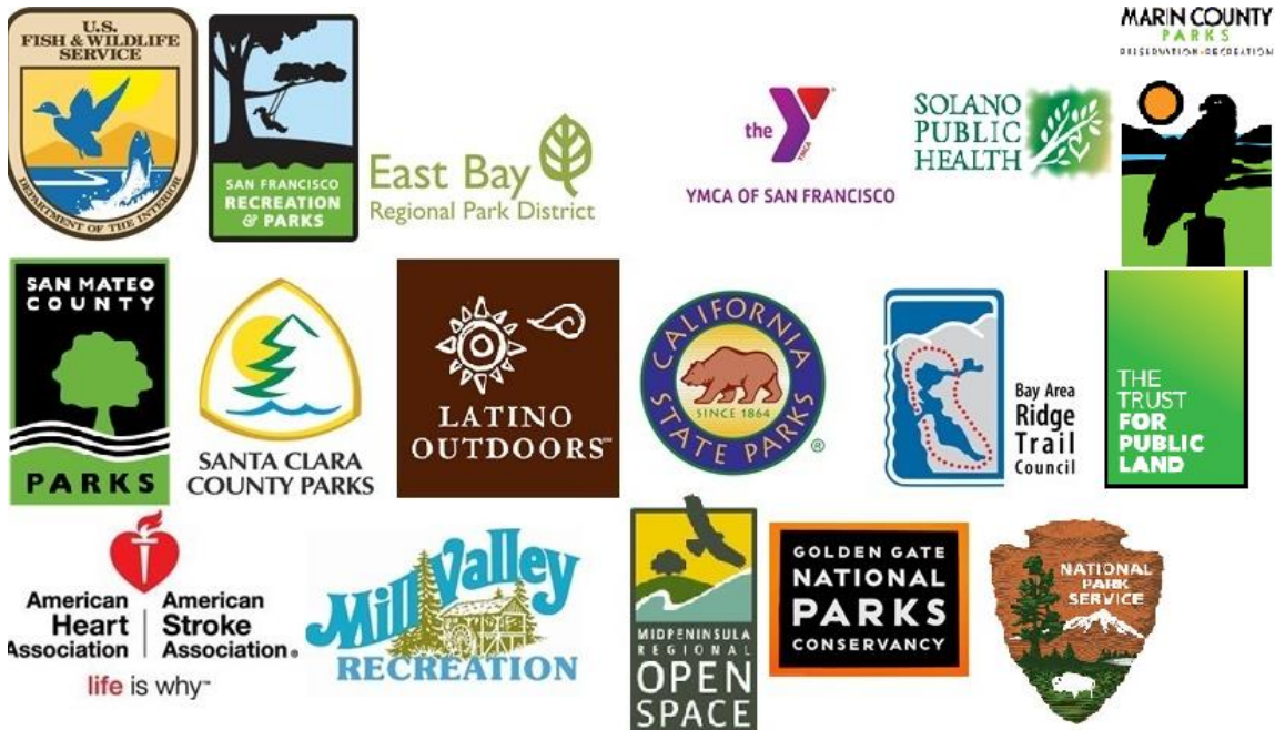
Current agencies that have signed the MOU